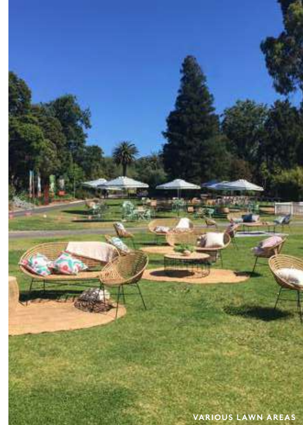
VARIOUS LAWN AREAS

The four lawns and six Pavilions scattered throughout the Melbourne Zoo grounds are just right for a casual outdoor function. Perfect for our Family day BBQ package, plenty of entertainment and outdoor furniture can be hired for use in these spaces and customised to your event style.